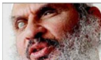
The Blind Sheikh