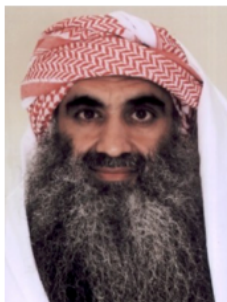
Khalid Sheikh Mohammed