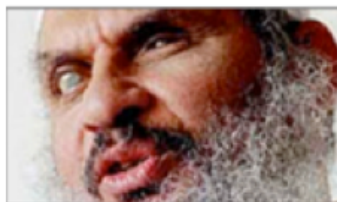
The Blind Sheikh